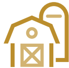
Farmers and ranchers